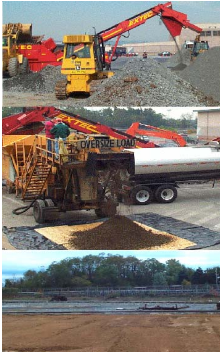
Figure 3. Encapco Treatment Process at NSA Mechanicsburg, PA From top to bottom the photographs show the following: (a) soil excavation and screening process; (b) pug mill and emulsion tanker truck; and (c) treated soil awaiting compaction and surfacing.

excavated area in 8-inch lifts and compacted with an 8 ton Ingersoll-Rand smooth wheel compactor (see Figure 3c). After compaction was completed, Encapco collected four in-place treated soil samples from the compacted sub-base/base of the parking lot. The samples were analyzed using USEPA Method 6010 for total lead and zinc and 1311/6010 for TCLP lead and zinc concentrations.