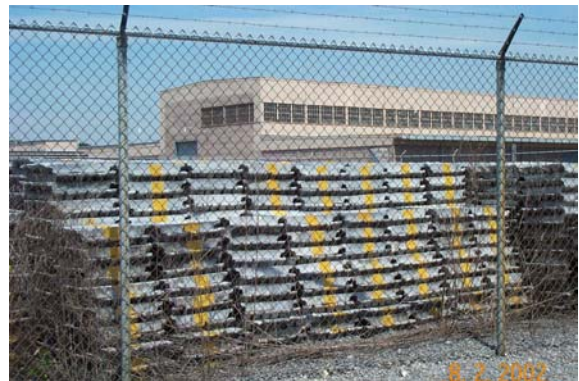
Figure 2. Lead ingots stacked within fenced area